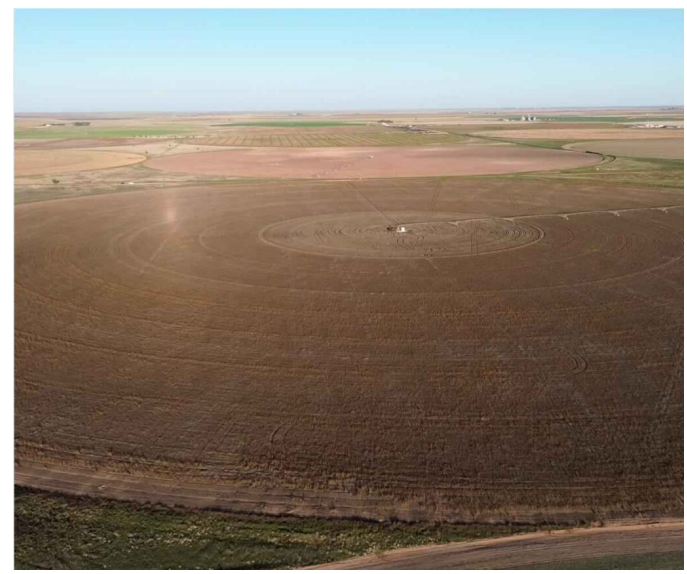
@2025 \; Glenn \; Cummings \; Real \; Estate \; | \; \underline{LandBrokerWebsites.com}