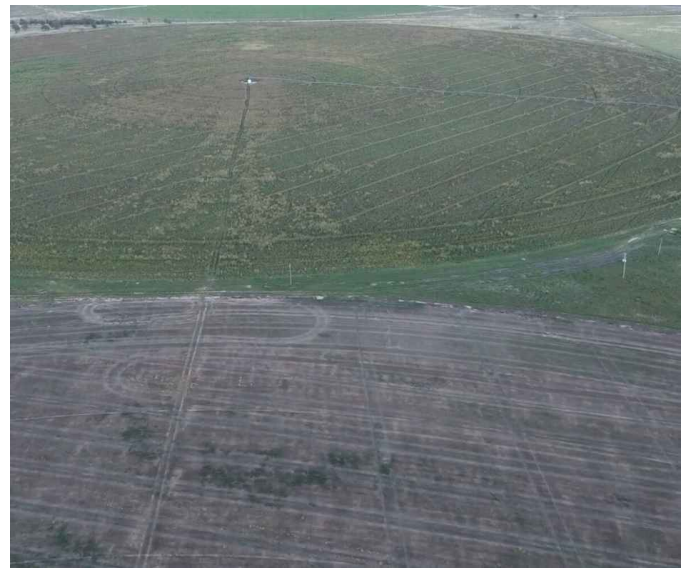
@2025 Glenn Cummings Real Estate | LandBrokerWebsites.com