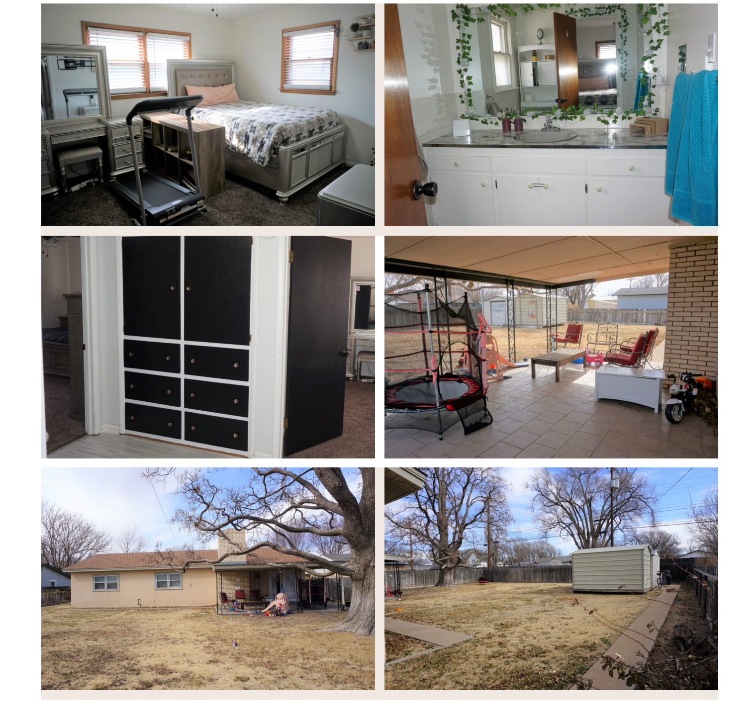
@2025 \; Glenn \; Cummings \; Real \; Estate \; | \; \underline{\text{LandBrokerWebsites.com}}